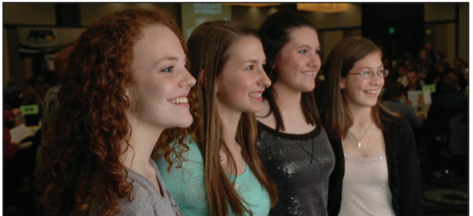
Four for harmony: A quartet from the Kearney High School Music Department provided delegates with a fine rendition of the Star Spangled Banner.

NSEA also presented the Champion of Education Award to KMTV Channel 3 in Omaha, for excellence in reporting on a voter ID law considered by the Legislature in 2012.