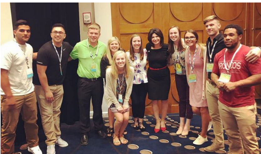
Being in Beantown: It wasn't all work – SEAN members had some fun and got to see various sites while in Boston in June. Clockwise from top: Discussion during the NEA Student Leadership Conference (SLC); Celebrating a social justice award at the SLC; Community Outreach Legacy Project at Everett Elementary; SEAN members with NEA President Lily Eskelsen-García; at the site of the first public school in Boston.