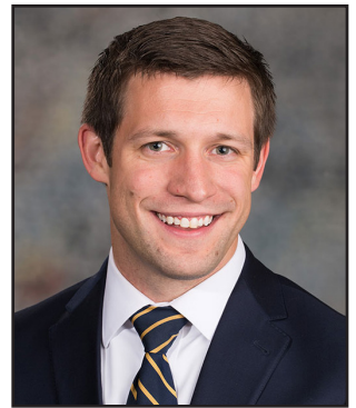
Senator Adam Morfeld

To sign up, go to: www.nsea.org/2018SEANLobby