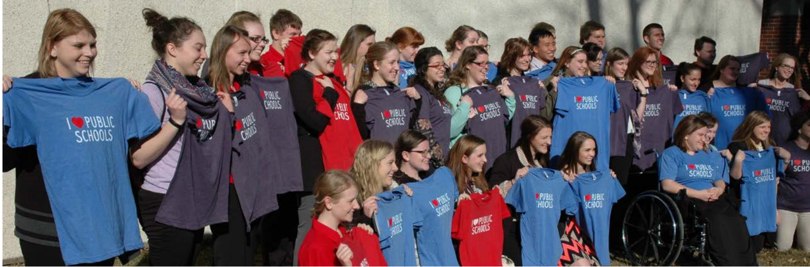
Proudly Displayed: Attendees at SEAN's 2016 Spring Conference display the t-shirts they received from Nebraska Loves Public Schools.