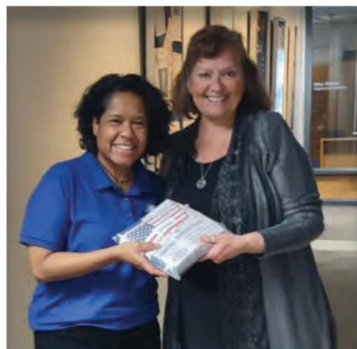
From Us to You, Red, White & Blue

This gesture—small in scale, but powerful in symbolism—demonstrates the continued leadership and generosity of Nebraska's retired educators. Their commitment to the profession doesn't end with retirement; it lives on in the ways they continue to uplift their colleagues and the association, one flag at a time.