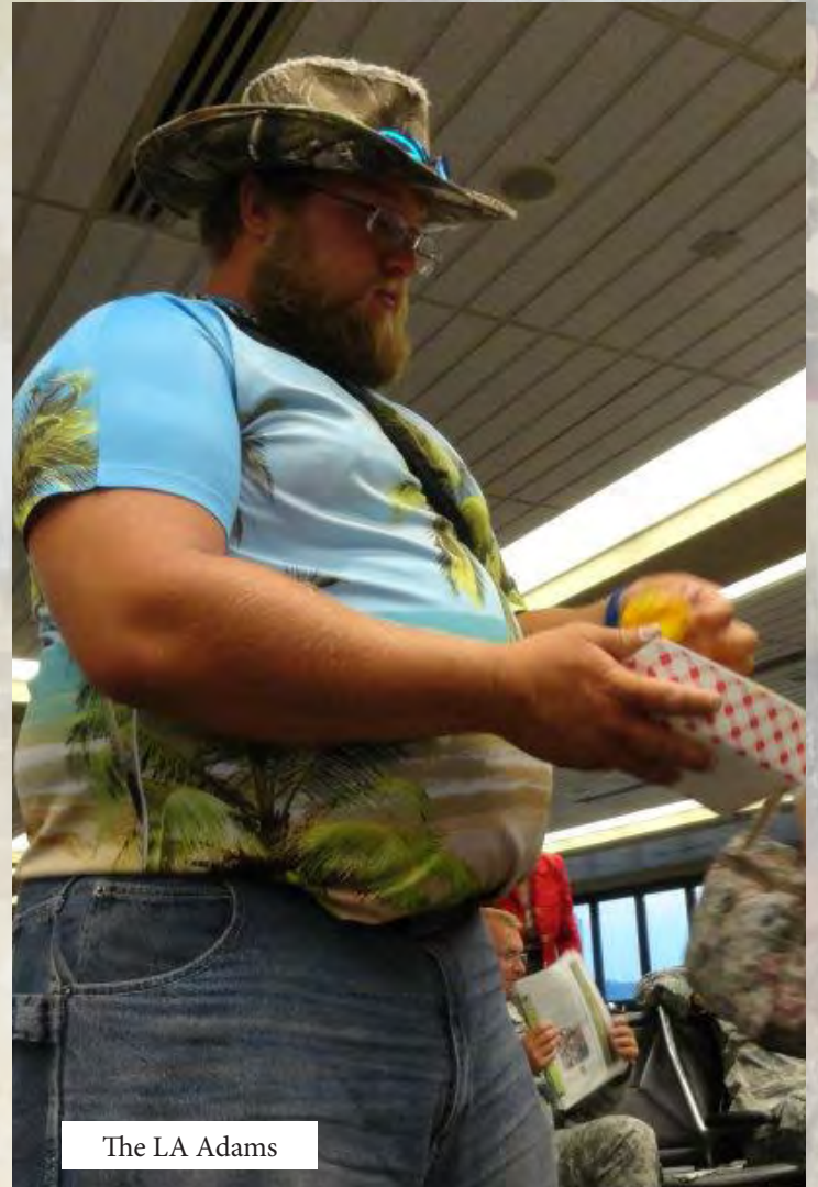
The LA Adams