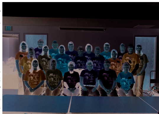
Retirees and students at the Kearney site.