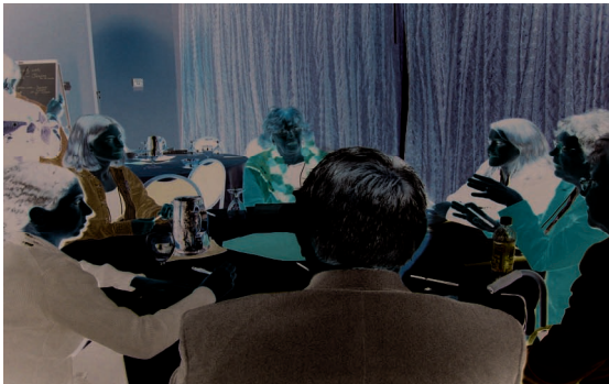
Sectional on NSEA-Retired's Nationally Recognized Intergenerational Mentoring Program

NEA's Western Region holds an annual Conference, attended by students, actives, and retirees from the region's nine states. This year the Omaha Qwest Center was home to several informative sectionals and other activities. Nebraska's member associations: SEAN, NSEA, and NSEA-Retired, hosted the three-day event.